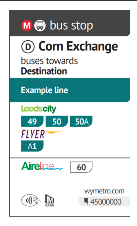
Figure 4 - Example City Centre Core Services and Strategic Services Flag